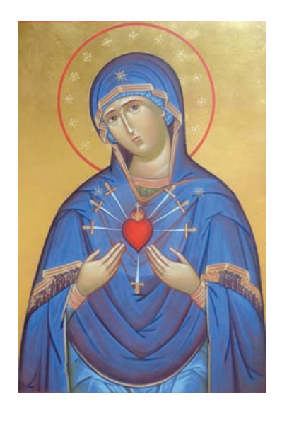
Our Lady of Sorrows, Pray for us!

Sunday Contributions.......$ 650.00 Needs of Canadian Church .......$ 20.00